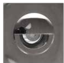
CLEO SQUARE 34° (SQ34)