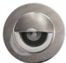
CLEO ROUND 25° (RO25)