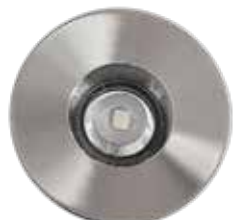
CLEO ROUND (RO)