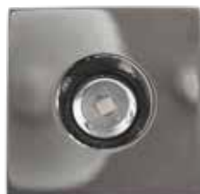
CLEO SQUARE (SQ)