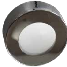
MAJA SURFACE SMALL (SS) Stainless steel