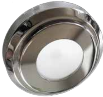
MAJA SURFACE BIG (SS) Stainless steel